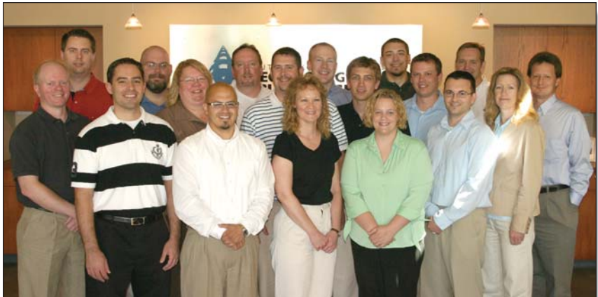
The staff of DocuTAP is ready for the move into their new offices following the "graduation" of the company from the South Dakota Technology Business Center.